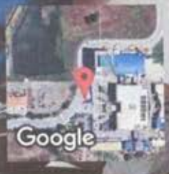
Bacoor, Calabarzon, Philippines CXJB+HX3, New Bacoor City Hall Access Rd, Bacoor, Cavite, Philippines Thursday, 07th March 2024 02:52 PM ICT - JOINT COMMITTEE HEARING 4TH FLOOR AT MSBR CONFERENCE ROOM