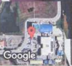
Bacoor, Calabarzon, Philippines 229 New Bacoor City Hall Access Rd, Bacoor, Cavite, Philippines Thursday, 21st March 2024 02:16 PM PCO 2024-166 COMMITTEE HEARING MSBR CONFERENCE ROOM 4TH FLOOR (FBA)