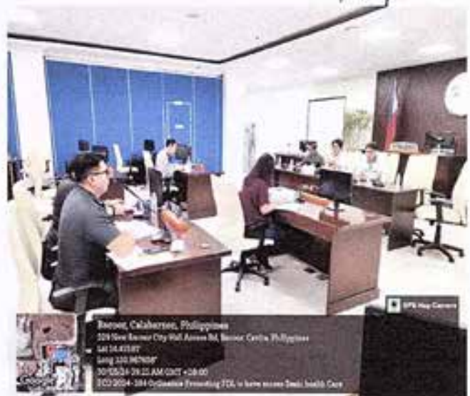
Bacoor, Calabarzon, Philippines 229 New Bacoor City Hall Annex Rd, Bacoor, Cavite, Philippines Lat: 14.432837 Long: 120.967649 30/05/24 09:32 AM GMT +08:00 PCO 2024-184 Ordinance Promoting PCL to have access Basic Health Care