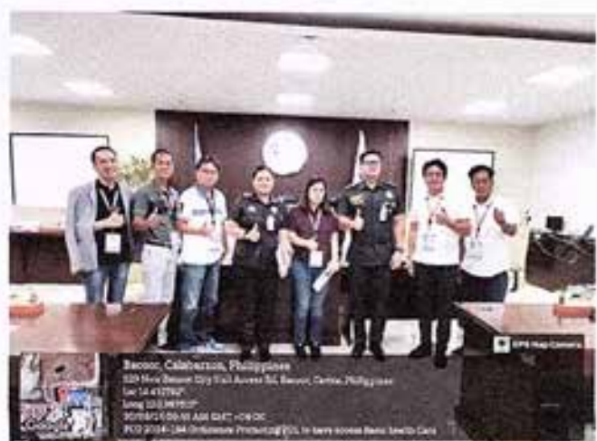
Bacoor, Calabarzon, Philippines 229 New Bacoor City Hall Annex Rd, Bacoor, Cavite, Philippines Lat: 14.432837 Long: 120.967649 30/05/24 09:36 AM GMT +08:00 PCO 2024-184 Ordinance Promoting PCL to have access Basic Health Care