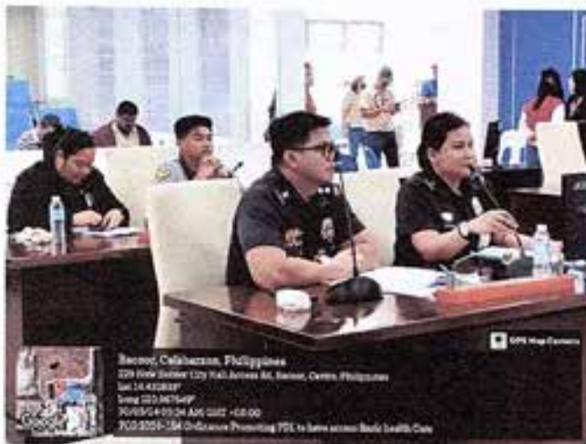
Bacoor, Calabarzon, Philippines 229 New Bacoor City Hall Annex Rd, Bacoor, Cavite, Philippines Lat: 14.432837 Long: 120.967649 30/05/24 09:34 AM GMT +08:00 PCO 2024-184 Ordinance Promoting PCL to have access Basic Health Care