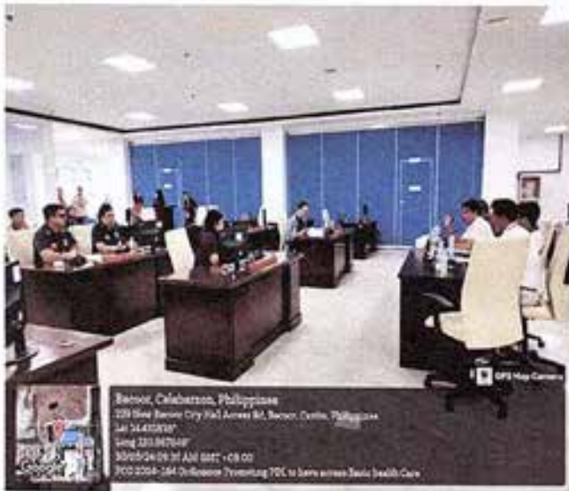
Bacoor, Calabarzon, Philippines 229 New Bacoor City Hall Annex Rd, Bacoor, Cavite, Philippines Lat: 14.432837 Long: 120.967649 30/05/24 09:31 AM GMT +08:00 PCO 2024-184 Ordinance Promoting PCL to have access Basic Health Care