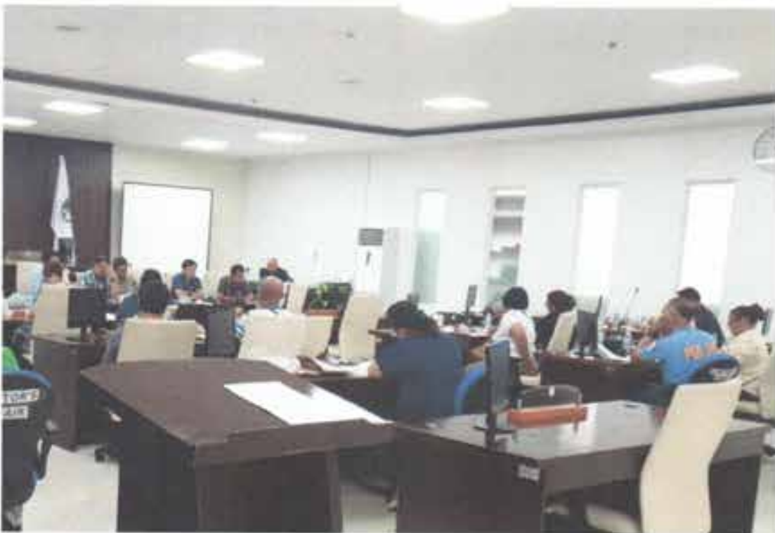
PHOTOS OF THE COMMITTEE HEARING NO. POPS 042 S-2024 PCO 2024-219 "AN ORDINANCE AMENDING CITY ORDINANCE No. 176-2021"