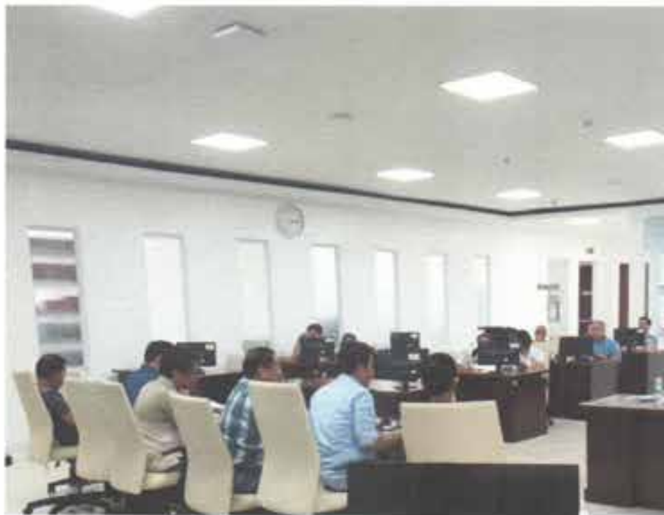
PHOTOS OF THE COMMITTEE HEARING NO. POPS 043 S-2024