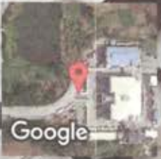
Bacoor, Calabarzon, Philippines CXJ8+HX3, New Bacoor City Hall Access Rd, Bacoor, Cavite, Philippines Thursday, 18th January 2024 04:29 PM JOINT COMMITTEE HEARING MSBR CONFERENCE ROOM 4TH FLOOR (ICT)