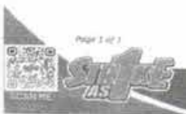
HON. ROWENA BAUTISTA-MENDILA Acting City Mayor