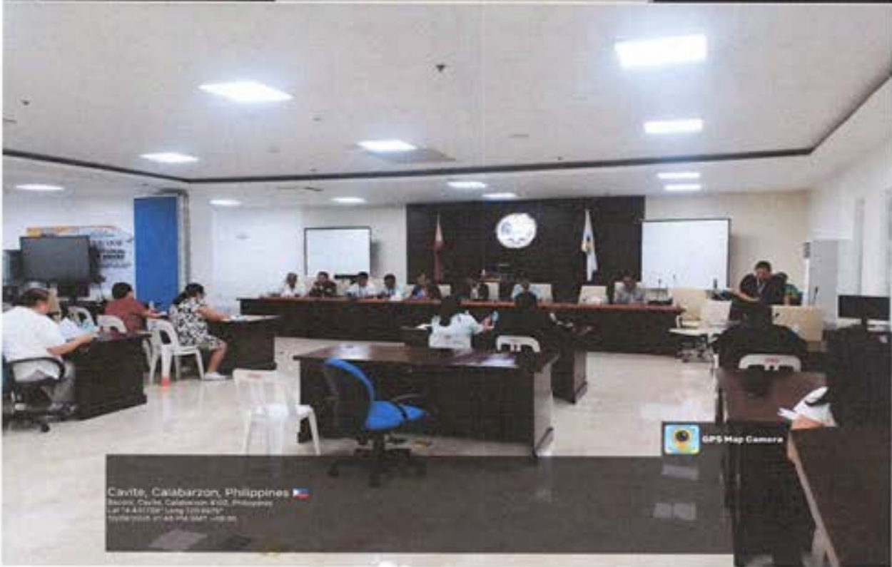
PHOTOS OF THE JOINT COMMITTEE HEARING NO. EAGR-011-2025 PCO 2025-047 "ORDINANCE CREATING/ABOLISHING VARIOUS PLANTILLA POSITIONS"