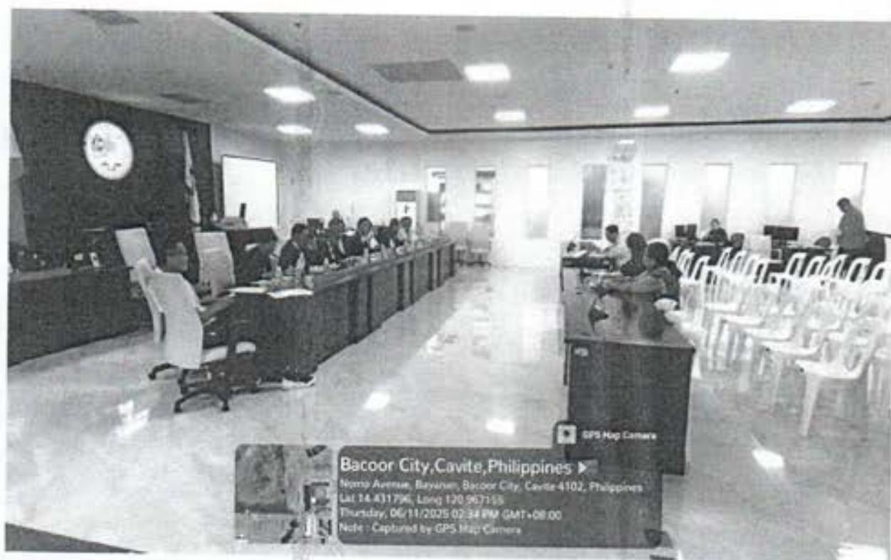
PHOTOS OF THE JOINT COMMITTEE HEARING NO. EAGR-022-2025 PCO 2025-055A "ORDINANCE CREATING VARIOUS FOOD SERVICE UNIT (FSU)"