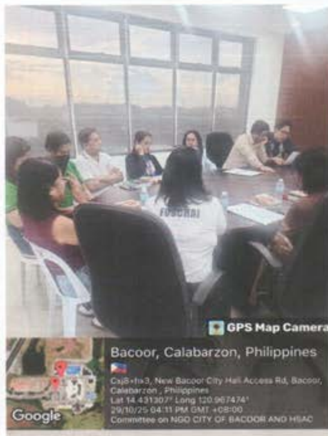
PHOTO DOCUMENTATION NO. NGO-052-S-2025