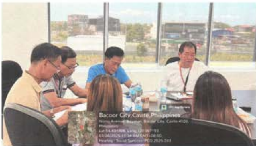
Bacoor City, Cavite, Philippines Nolas Avenue, Bacoor, Bacoor City, Cavite 4102, Philippines Lat: 14.431698, Long: 120.967193 Date: 2025-03-11 08:44 AM GMT+08:00 Meeting: Social Services, PCO 2025-243

Subject: PCO 2025-243 AN ORDINANCE MANDATING THE ESTABLISHMENT OF A LOCAL PANTAWID PAMILYANG PILIPINO PROGRAM BENEFICIARIES DATABASE AND THE ENROLLMENT OF PANTAWID PAMILYANG PILIPINO PROGRAM BENEFICIARIES (4Ps) IN THE CITY GOVERNMENT OF BACOOR AND THE ISSUANCE OF A LOCAL PANTAWID PAMILYANG PILIPINO PROGRAM BENEFICIARIES. (dated 03 March 2025)