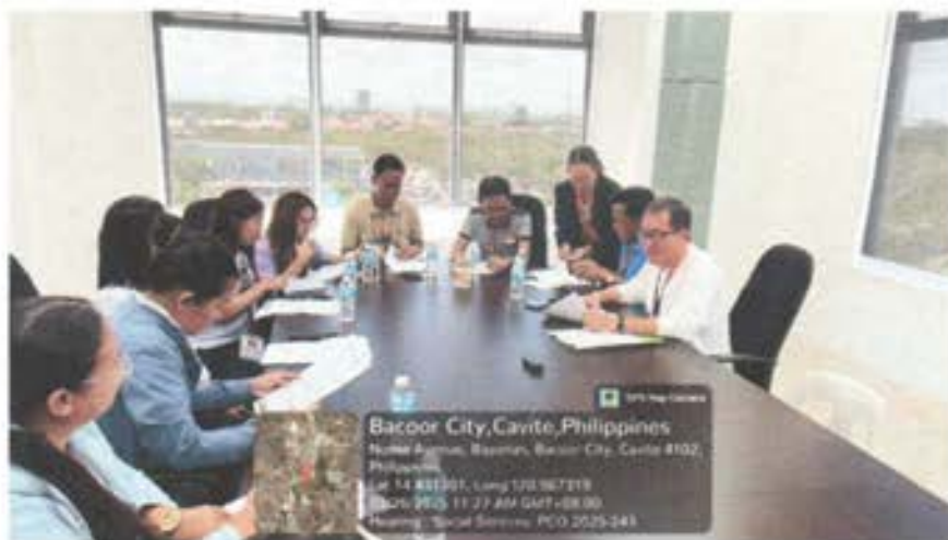
Bacoor City, Cavite, Philippines Nolas Avenue, Bacoor, Bacoor City, Cavite 4102, Philippines Lat: 14.431698, Long: 120.967193 Date: 2025-03-11 11:27 AM GMT+08:00 Meeting: Social Services, PCO 2025-243