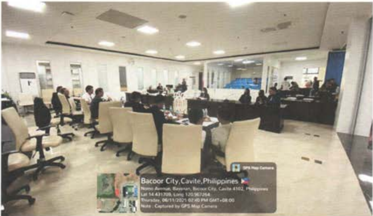
PHOTOS OF THE JOINT COMMITTEE HEARING NO. EAGR-023-2025 PCR 248-2025 "RESOLUTION RECOGNIZING RECIPIENTS OF LATIN HONORS INCENTIVES"