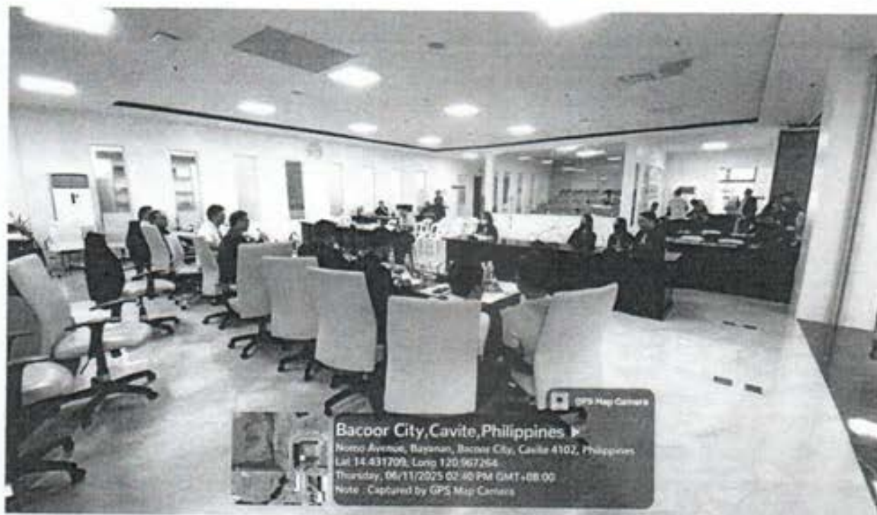
PHOTOS OF THE JOINT COMMITTEE HEARING NO. EAGR-023-2025 PCR 248-2025 "RESOLUTION RECOGNIZING RECIPIENTS OF LATIN HONORS INCENTIVES"