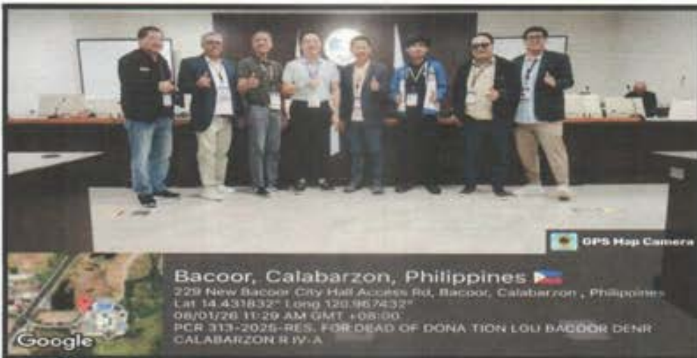
PHOTO OF COMMITTEE HEARING NO. ENR 09-S-2025

PCR 313-2025 DODA ON BEHALF OF THE CITY GOVERNMENT OF BACOOR WITH THE DENR-EMB REGION IV-A