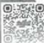
STRIKE B. REVILLA City Mayor