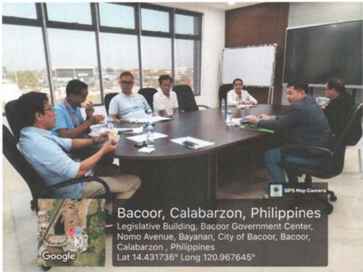
Bacoor, Calabarzon, Philippines Legislative Building, Bacoor Government Center, Nomo Avenue, Bayanan, City of Bacoor, Bacoor, Calabarzon, Philippines Lat 14.431736° Long 120.967645°

Office of the Sangguniang Panlungsod Received by MAH 2025 Date: 2025 Time: 8:30 am