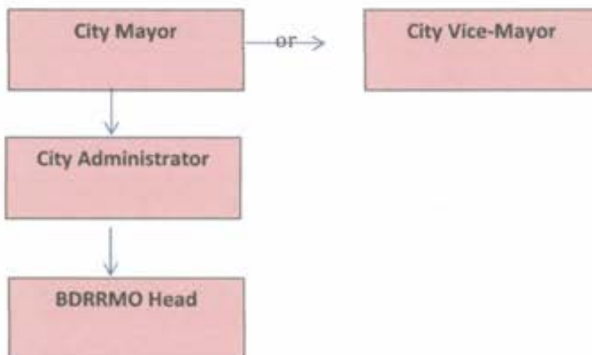
Direction and Control Chain of Command During Emergencies (Fig. 1)

11.4. Respect and Obeisance to Chain of Command. - All employees and officials of the city government shall respect and obey the chain of command indicated above during times of emergency. The failure of any employee or official to adhere to the said chain of command without justifiable cause shall be considered a ground for administrative liability.