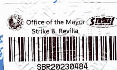
STRIKE B. REVILLA City Mayor

Address: Bacoor Government Center, Bacoor Blvd., Brgy. Bayanan, City of Bacoor, Cavite Trunkline: 434-1111 Website: www.bacoor.gov.ph